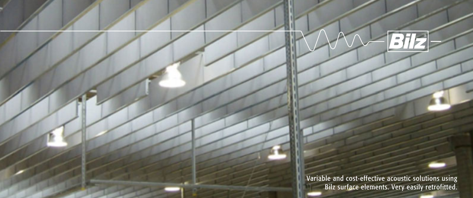
Variable and cost-effective acoustic solutions using Bilz surface elements. Very easily retrofitted.

When a sound wave strikes a body it is partially absorbed and partially reflected depending on the hardness and porosity of the material. The ratio between the occurring and absorbed sound energy is therefore the sound absorption coefficient, which usually lies between 0 (complete reflection) and 1 (complete absorption).